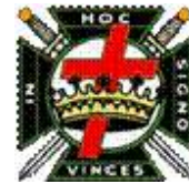
Order of the Temple

As I have gone through these degrees there were No Improper oaths, or any other improper conduct. Just some good clean story telling and knowledge passed along.